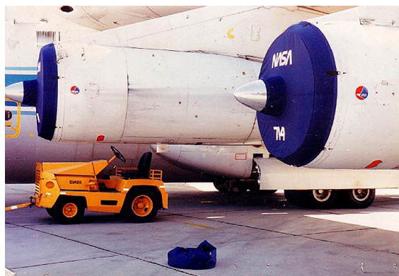
Intake Covers for Lockheed C-141