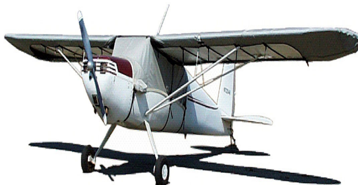
Cessna 120 Canopy Cover & Wing Covers