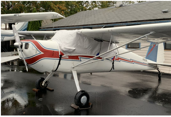
Cessna 140 Over-Top Canopy Cover