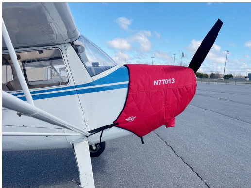
Cessna 140 Insulated Engine Cover

This cover type is made from Silver Acrylic Sunbrella canvas and is 100% lined with a soft and smooth microfiber. Bruce's Custom Covers developed this material combination especially for aircraft protection. The outer material is medium weight and treated for water resistance, UV resistance and anti-static buildup. The inner lining is a very soft and smooth microfiber to prevent scratching. The material is very reflective, and tests show that the cabin interior temperature can be reduced to near-ambient temperature on the hottest of days. It is water, ice and snow repellent, yet breathable to allow moisture to escape from between the cover and the aircraft surface.