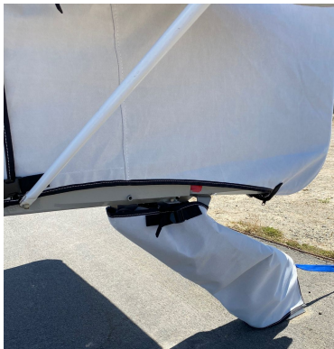
Kitfox Full Cover Set

ALL-YEAR USE MATERIAL - Made with Silver Acrylic Sunbrella canvas, the all-year use material is the best option for sun protection and cover longevity. This heavier more durable material is intended for all weather conditions, such as rain and snow or lots of sun.