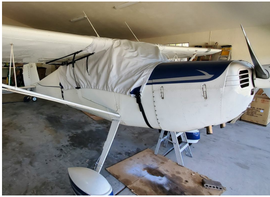
Cessna 140 Canopy Cover, Over Top Type, extends to cover gas caps