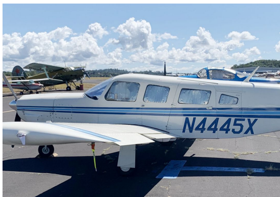
Piper PA32-300 HeatShield Set

This cover type is made from Silver Acrylic Sunbrella canvas and is 100% lined with a soft and smooth microfiber. Bruce's Custom Covers developed this material combination especially for aircraft protection. The outer material is medium weight and treated for water resistance, UV resistance and anti-static buildup. The inner lining is a very soft and smooth microfiber to prevent scratching. The material is very reflective, and tests show that the cabin interior temperature can be reduced to near-ambient temperature on the hottest of days. It is water, ice and snow repellent, yet breathable to allow moisture to escape from between the cover and the aircraft surface.