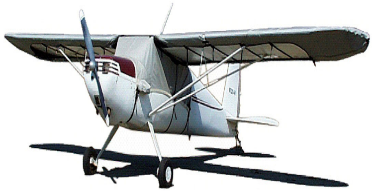
Cessna 120 Canopy Cover & Wing Covers