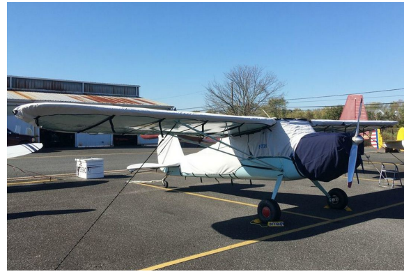
Cessna 140 Insulated Engine, Canopy, Empennage & Wing Covers