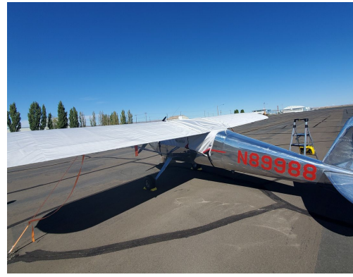
Cessna 140 Wing Covers