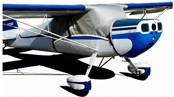
Cessna 120 Over-Top Canopy Cover