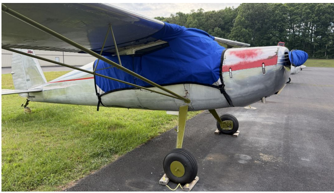
Cessna 140 Canopy Cover, over top type, Prop Cover