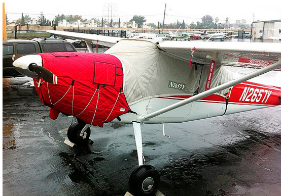
Cessna 180 Insulated Engine Cover

This cover type is made from Silver Acrylic Sunbrella canvas and is 100% lined with a soft and smooth microfiber. Bruce's Custom Covers developed this material combination especially for aircraft protection. The outer material is medium weight and treated for water resistance, UV resistance and anti-static buildup. The inner lining is a very soft and smooth microfiber to prevent scratching. The material is very reflective, and tests show that the cabin interior temperature can be reduced to near-ambient temperature on the hottest of days. It is water, ice and snow repellent, yet breathable to allow moisture to escape from between the cover and the aircraft surface.