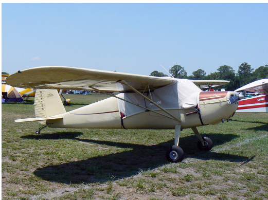
Cessna 140 Over-Top Canopy Cover

This cover type is made from Silver Acrylic Sunbrella canvas and is 100% lined with a soft and smooth microfiber. Bruce's Custom Covers developed this material combination especially for aircraft protection. The outer material is medium weight and treated for water resistance, UV resistance and anti-static buildup. The inner lining is a very soft and smooth microfiber to prevent scratching. The material is very reflective, and tests show that the cabin interior temperature can be reduced to near-ambient temperature on the hottest of days. It is water, ice and snow repellent, yet breathable to allow moisture to escape from between the cover and the aircraft surface.