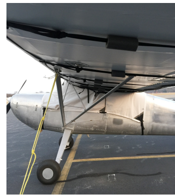
Cessna 140 Canopy Cover, Wing Covers