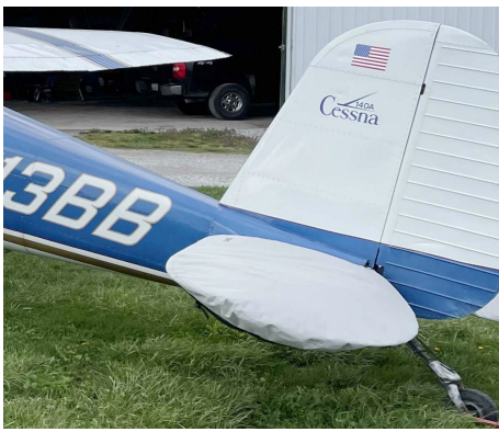
Cessna 140 Horizontal Stabilizer Covers