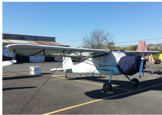
Cessna 140 Canopy, Engine, Wing & Empennage Covers