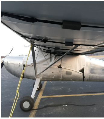
Cessna 140 Canopy Cover, Wing Covers