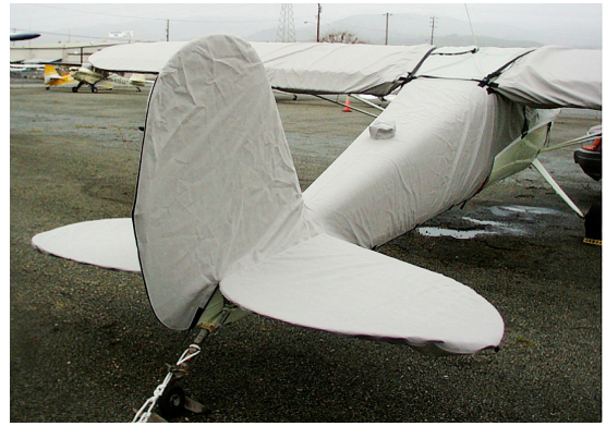
Cessna 120 Empennage & Wing Covers