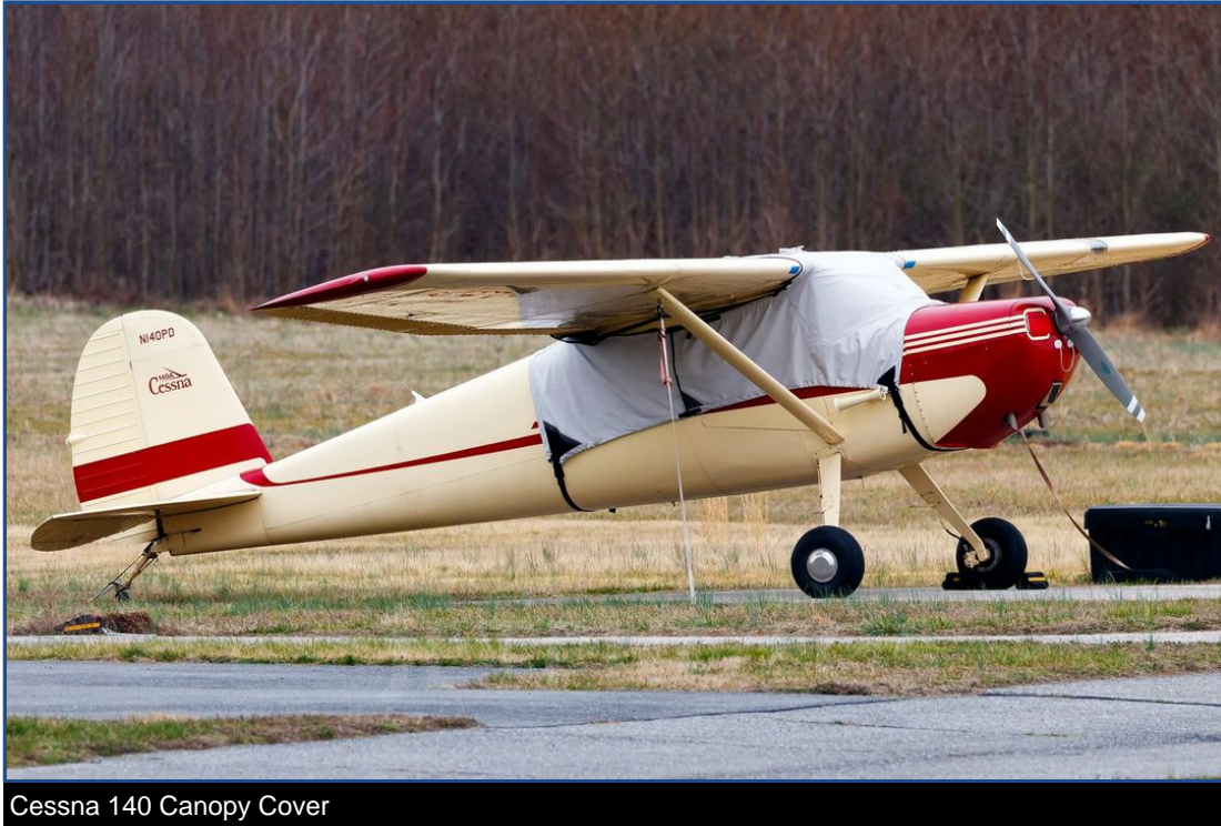
Cessna 140 Canopy Cover