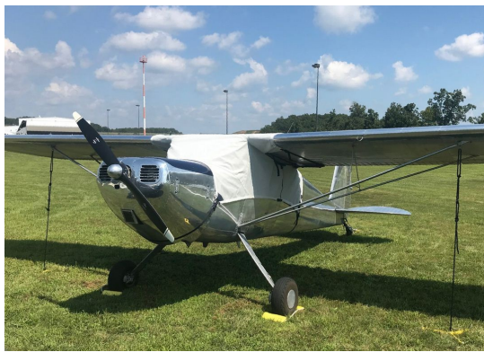
Cessna 140 Over-Top Canopy Cover