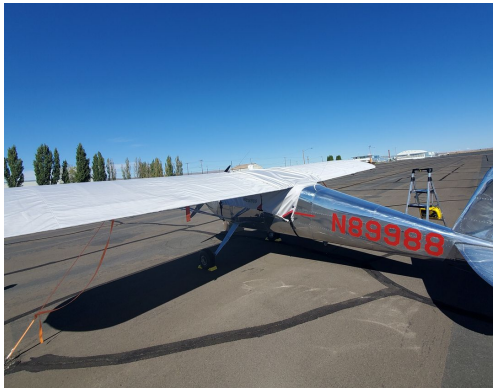
Cessna 140 Wing Covers