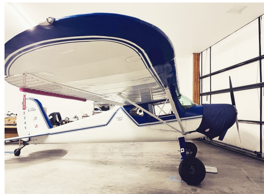
Cessna 140 Insulated Engine Cover