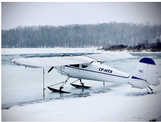
Cessna 140 Wing & Tail Covers