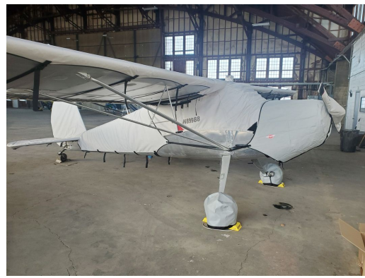
Cessna 140 Canopy, Wings, Prop, Tires & Empennage Covers