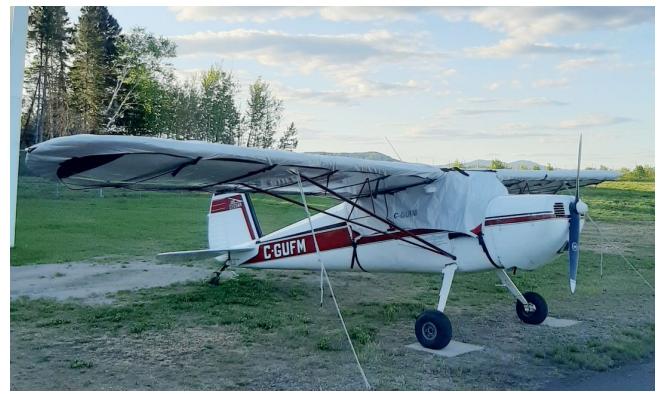
Cessna 140 Canopy Cover (Over-Top Type), Wing Covers