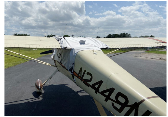
Cessna 140 Over-Top Canopy Cover