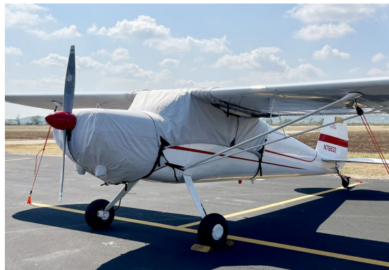
Cessna 140 Canopy Cover & Engine Cover