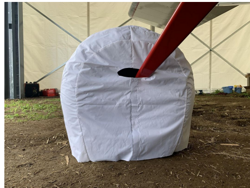
Cub Crafters CC19 Oversize Tire Covers, test fit cover