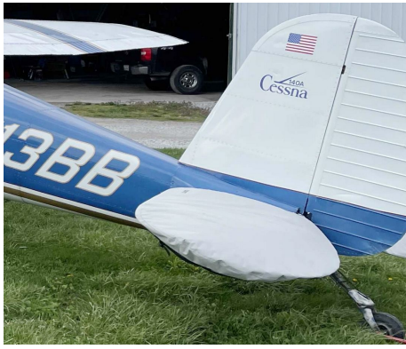
Cessna 140 Horizontal Stabilizer Covers