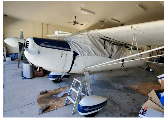
Cessna 140 Canopy Cover (Over-Top Type), Wing Covers Cessna 140 Canopy Cover, Over Top Type, extends to cover gas caps