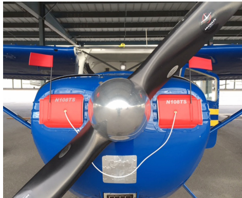
Cessna 170 Engine Inlet Covers (cards)