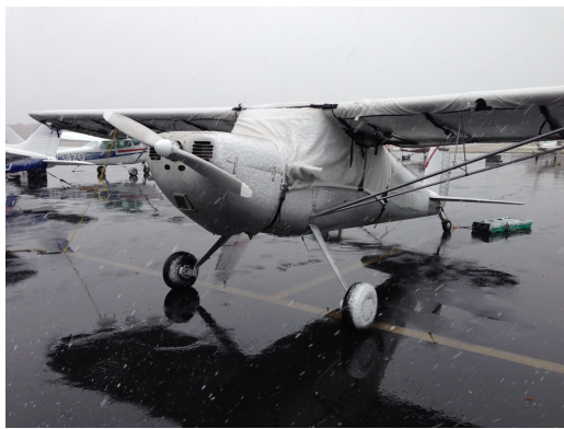
Cessna 120/140 Canopy and Wing Covers