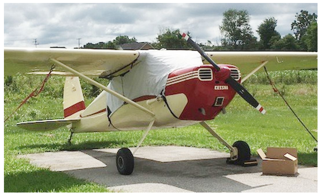
Cessna 140 Canopy Cover