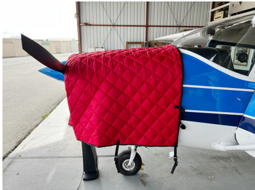
Insulated Hangar Blanket on Cessna 182

This cover type is made from Silver Acrylic Sunbrella canvas and is 100% lined with a soft and smooth microfiber. Bruce's Custom Covers developed this material combination especially for aircraft protection. The outer material is medium weight and treated for water resistance, UV resistance and anti-static buildup. The inner lining is a very soft and smooth microfiber to prevent scratching. The material is very reflective, and tests show that the cabin interior temperature can be reduced to near-ambient temperature on the hottest of days. It is water, ice and snow repellent, yet breathable to allow moisture to escape from between the cover and the aircraft surface.