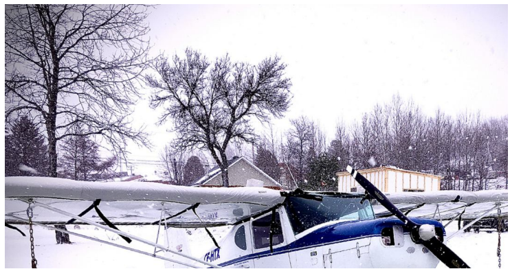
Cessna140 Wing Covers Winter Use