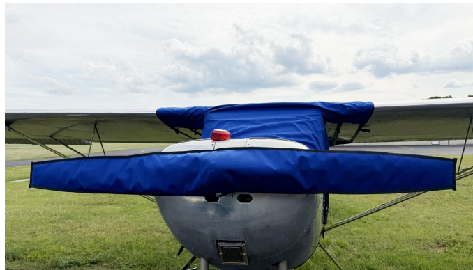
Cessna 140 Insulated Propellor/Spinner Cover 2 Blade