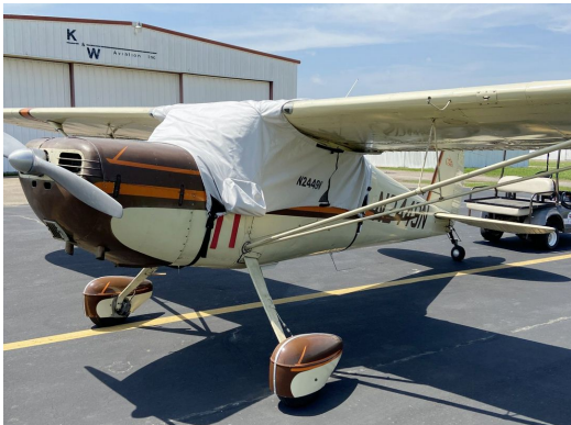
Cessna 140 Over-Top Canopy Cover

This cover type is made from Silver Acrylic Sunbrella canvas and is 100% lined with a soft and smooth microfiber. Bruce's Custom Covers developed this material combination especially for aircraft protection. The outer material is medium weight and treated for water resistance, UV resistance and anti-static buildup. The inner lining is a very soft and smooth microfiber to prevent scratching. The material is very reflective, and tests show that the cabin interior temperature can be reduced to near-ambient temperature on the hottest of days. It is water, ice and snow repellent, yet breathable to allow moisture to escape from between the cover and the aircraft surface.