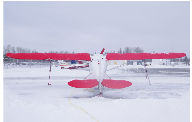
FOR INTERIOR USE. Cub Crafters CC-11 Insulated Hangar Blanket, available in Red or Silver, Cessna 120 Insulated Engine & Prop Covers, Wing & Tail Covers