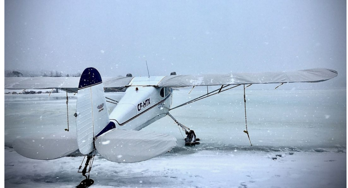
Cessna 140 Wing & Tail Covers