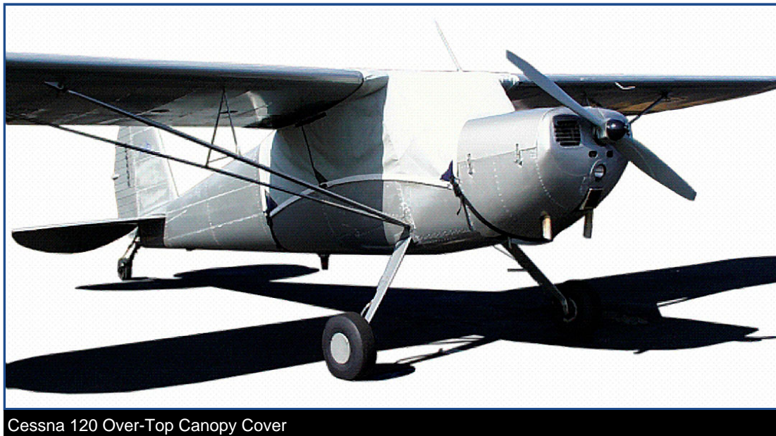
Cessna 120 Over-Top Canopy Cover