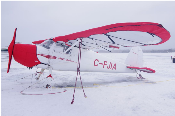
Cessna 120 Insulated Engine & Prop Covers, Wing & Tail Covers