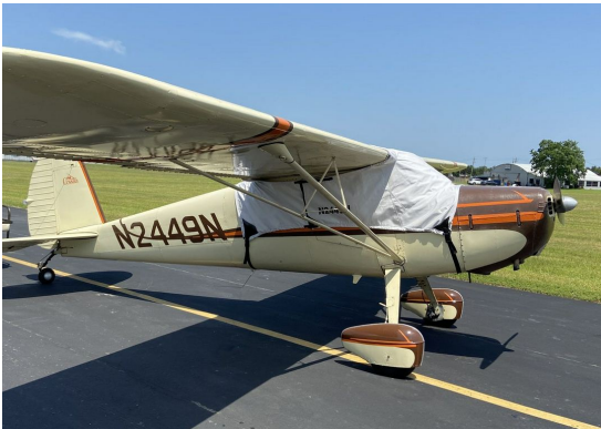
Cessna 140 Over-Top Canopy Cover

This cover type is made from Silver Acrylic Sunbrella canvas and is 100% lined with a soft and smooth microfiber. Bruce's Custom Covers developed this material combination especially for aircraft protection. The outer material is medium weight and treated for water resistance, UV resistance and anti-static buildup. The inner lining is a very soft and smooth microfiber to prevent scratching. The material is very reflective, and tests show that the cabin interior temperature can be reduced to near-ambient temperature on the hottest of days. It is water, ice and snow repellent, yet breathable to allow moisture to escape from between the cover and the aircraft surface.