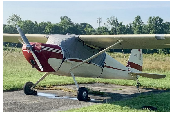
Cessna 140 Travel Weight Canopy Cover