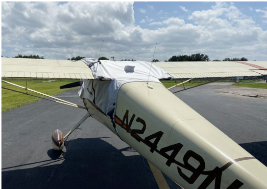
Cessna 140 Over-Top Canopy Cover