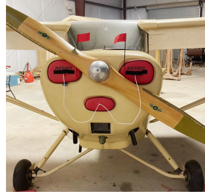
Aeronca 11AC Chief Engine Plugs