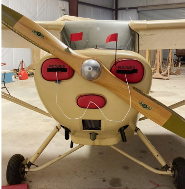
Aeronca 11AC Engine Inlet Plugs

Engine Inlet Plugs are custom fit for your Aeronca Chief 11AC, Super Chief 11CC intakes, made with heavy-duty vinyl material, and stuffed with a single block of sculpted urethane foam. Each plug has a zipper that allows the foam to be removed and dried if necessary. Engine plugs have warning flags that are visible from the cockpit or 'remove before flight' streamers sewn onto the face of the plugs. Most plugs are imprinted with the aircraft registration number in black for an extra charge. Storage bag NOT included. Engine plugs may be inserted after flight when the engine is still warm. Engine Inlet Plugs are commonly referred to as Cowl Plugs, Intake Plugs, Cowl Blocks, Engine Blocks, and Engine Bungs.