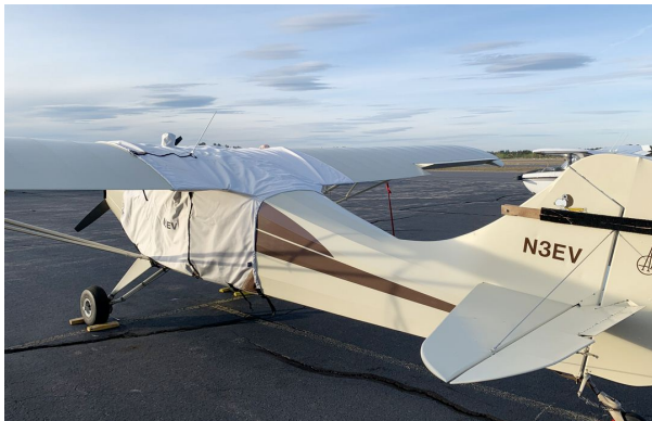
Aeronca Chief 11BC Extended Over-Top Canopy Cover

This cover type is made from Silver Acrylic Sunbrella canvas and is 100% lined with a soft and smooth microfiber. Bruce's Custom Covers developed this material combination especially for aircraft protection. The outer material is medium weight and treated for water resistance, UV resistance and anti-static buildup. The inner lining is a very soft and smooth microfiber to prevent scratching. The material is very reflective, and tests show that the cabin interior temperature can be reduced to near-ambient temperature on the hottest of days. It is water, ice and snow repellent, yet breathable to allow moisture to escape from between the cover and the aircraft surface.