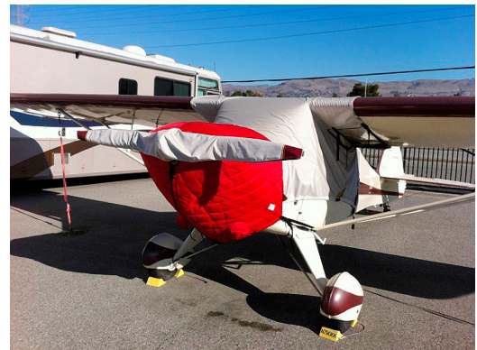
Aeronca Chief 11AC, Super Chief 11CC Insulated Engine Cover Taylorcraft Insulated Engine Cover, Prop and Canopy Covers