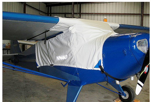
Taylorcraft BC12-D Over-the-top Canopy Cover