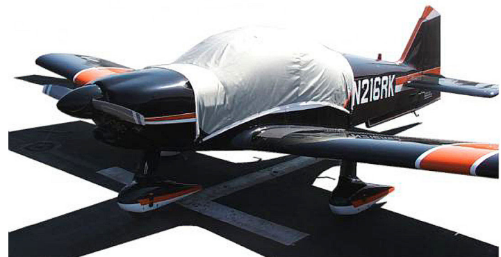
Robin R.2160 Canopy Cover