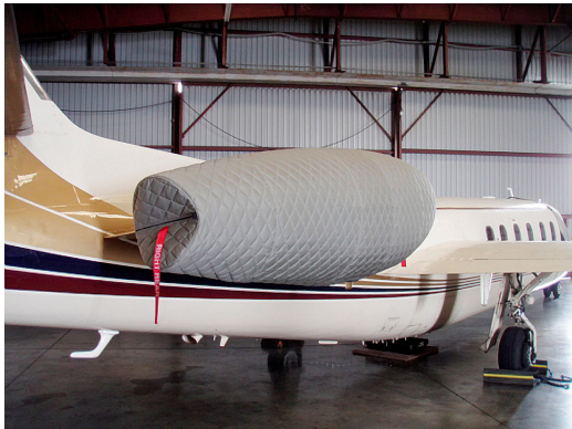
IAI Westwind 1124 Insulated Engine Nacelle Cover

instructions. The aircraft's registration number can be silkscreened onto the cover for an extra charge.