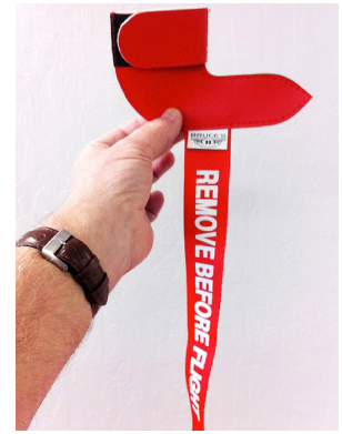
Standard Pitot Cover