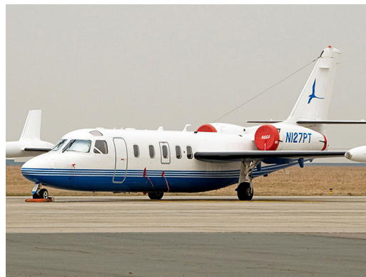
Engine Covers & Cockpit HeatShields

Cockpit Heatshields are interior sunshades for the aircraft's cockpit. The product is a unique composite of closed-cell foam with a silver mylar finish. The semi-rigid design is stiff enough to stand inside the window framing. The set folds up flat and is easily stored in the included storage sleeve. Some designs may require velcro and suction cups. Our Heatshields for jets are offered white side out because some aircraft manufacturers have issued advisories against reflective window inserts due to potential heat damage. A Heatshield is an excellent short-term remedy for cockpit overheating, but an external fabric cover is more effective for long-term protection.