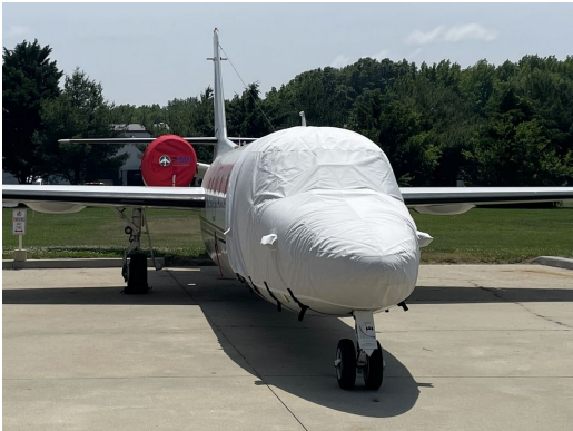
IAI 1124 Cockpit/Nose Cover Extended Aft Over Entry Door