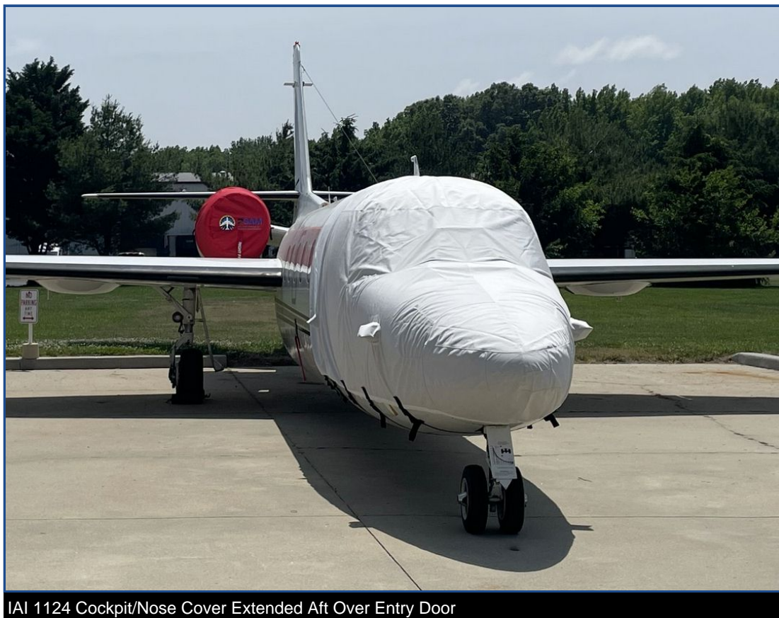
IAI 1124 Cockpit/Nose Cover Extended Aft Over Entry Door