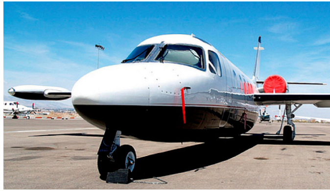
Westwind Engine Cover Set, Pitot Cover