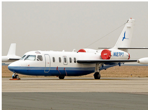
Engine Covers & Cockpit HeatShields

The Israel Aircraft Westwind 1123 Bikini Style Engine Covers are a single-piece design using a soft and smooth stretchy fabric. The cover stretches tightly over both the intake and exhaust, installing quickly and easily. These covers are designed to be used as hangar dust covers and have a useful life of approximately one year.