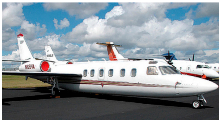
Westwind Engine Intake Plugs