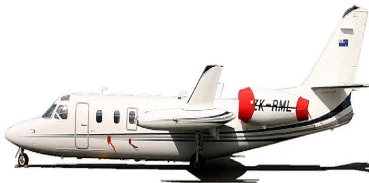
Jet Commander Engine Covers