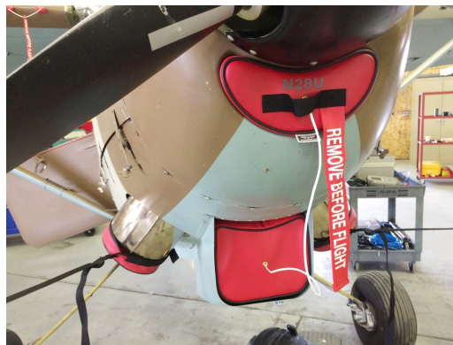
Siai Marchetti 1019 Engine Plugs, Prop Tie-Exhaust Covers