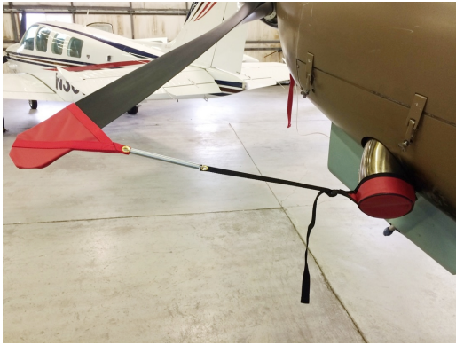
Siai Marchetti 1019 Prop Tie-Exhaust Covers

This cover type is made from Silver Acrylic Sunbrella canvas and is 100% lined with a soft and smooth microfiber. Bruce's Custom Covers developed this material combination especially for aircraft protection. The outer material is medium weight and treated for water resistance, UV resistance and anti-static buildup. The inner lining is a very soft and smooth microfiber to prevent scratching. The material is very reflective, and tests show that the cabin interior temperature can be reduced to near-ambient temperature on the hottest of days. It is water, ice and snow repellent, yet breathable to allow moisture to escape from between the cover and the aircraft surface.