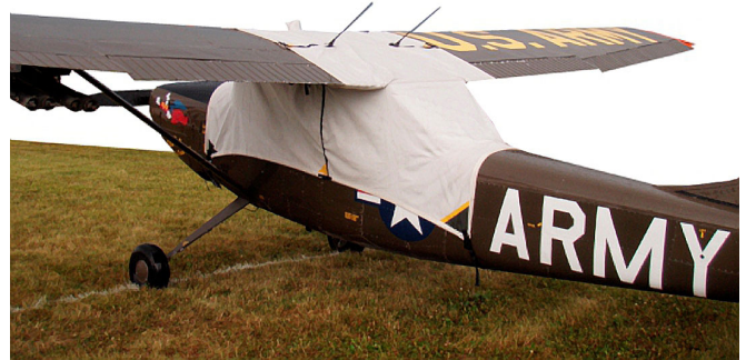
L-19 Canopy Cover (similar to Siai Marchetti 1019)