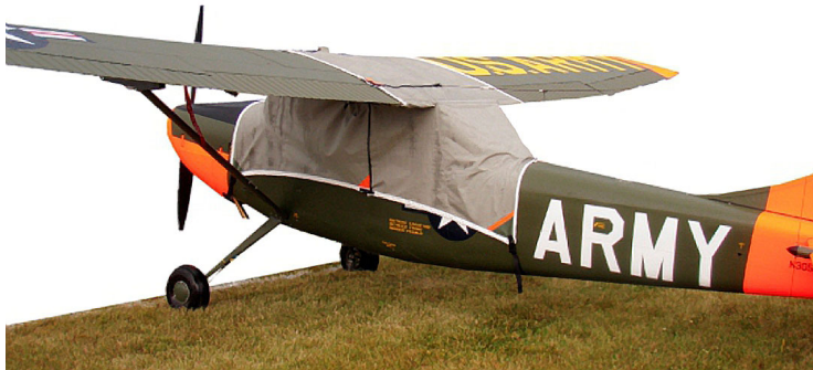
L-19 Canopy Cover (similar to Siai Marchetti 1019)

This cover type is made from Silver Acrylic Sunbrella canvas and is 100% lined with a soft and smooth microfiber. Bruce's Custom Covers developed this material combination especially for aircraft protection. The outer material is medium weight and treated for water resistance, UV resistance and anti-static buildup. The inner lining is a very soft and smooth microfiber to prevent scratching. The material is very reflective, and tests show that the cabin interior temperature can be reduced to near-ambient temperature on the hottest of days. It is water, ice and snow repellent, yet breathable to allow moisture to escape from between the cover and the aircraft surface.