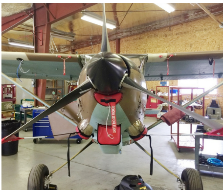
Siai Marchetti 1019 Engine Plugs, Prop Tie-Exhaust Covers