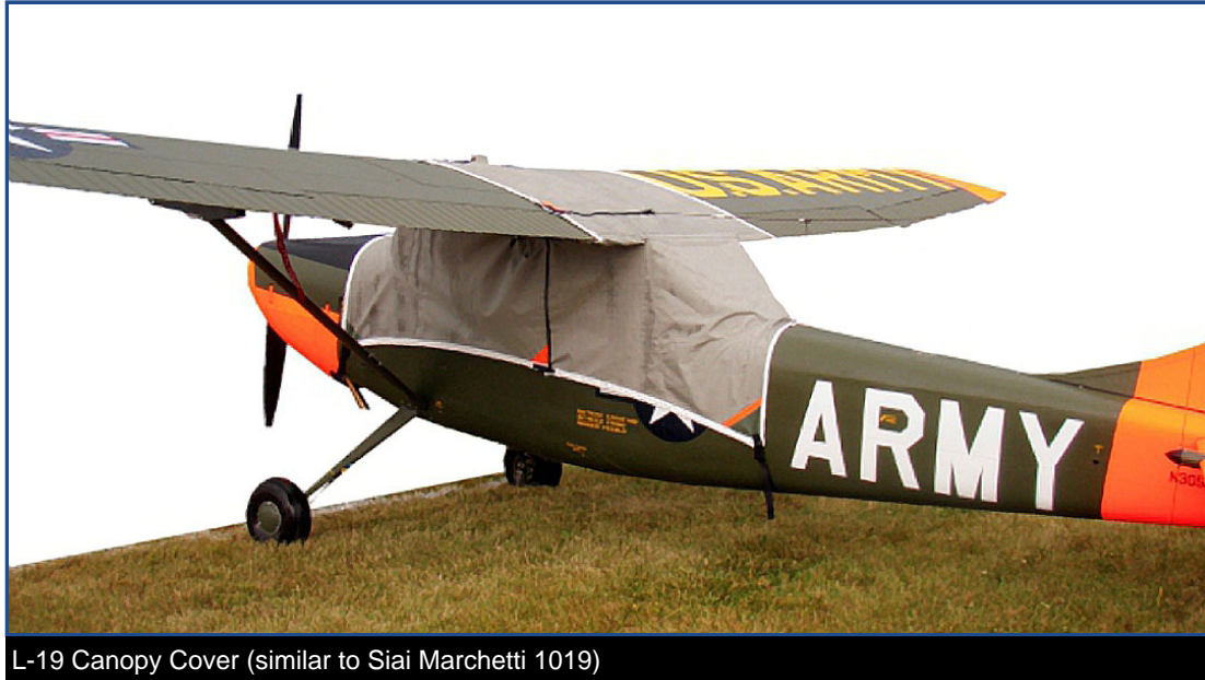
L-19 Canopy Cover (similar to Siai Marchetti 1019)