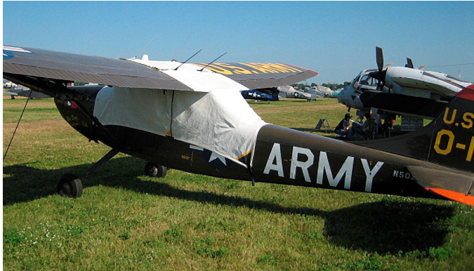
L-19 Canopy Cover (similar to Siai Marchetti 1019)

This cover type is made from Silver Acrylic Sunbrella canvas and is 100% lined with a soft and smooth microfiber. Bruce's Custom Covers developed this material combination especially for aircraft protection. The outer material is medium weight and treated for water resistance, UV resistance and anti-static buildup. The inner lining is a very soft and smooth microfiber to prevent scratching. The material is very reflective, and tests show that the cabin interior temperature can be reduced to near-ambient temperature on the hottest of days. It is water, ice and snow repellent, yet breathable to allow moisture to escape from between the cover and the aircraft surface.