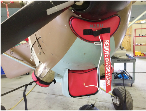
Siai Marchetti 1019 Engine Plugs, Prop Tie-Exhaust Covers

This cover type is made from Silver Acrylic Sunbrella canvas and is 100% lined with a soft and smooth microfiber. Bruce's Custom Covers developed this material combination especially for aircraft protection. The outer material is medium weight and treated for water resistance, UV resistance and anti-static buildup. The inner lining is a very soft and smooth microfiber to prevent scratching. The material is very reflective, and tests show that the cabin interior temperature can be reduced to near-ambient temperature on the hottest of days. It is water, ice and snow repellent, yet breathable to allow moisture to escape from between the cover and the aircraft surface.