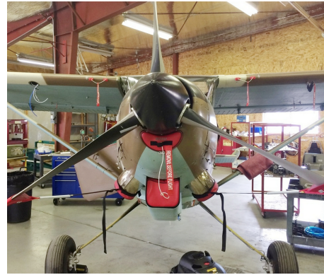
Siai Marchetti 1019 Engine Plugs, Prop Tie-Exhaust Covers